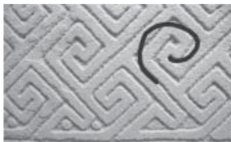
1 A detail of key pattern showing how it is derived from a spiral.