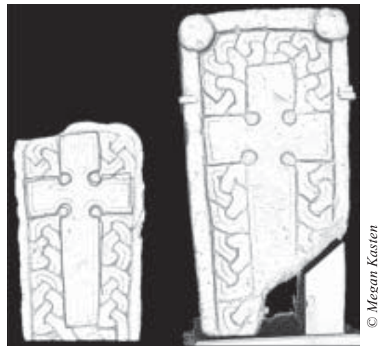
1 Inchinnan 1 and Govan 12. Although the crosses are of a different size, they are remarkably similar in proportion

Although the test to see if templates had been used in the figurative carving at Govan showed conclusively they had not, the comparative process did show a remarkable similarity in the shape and proportion of the crosses on Inchinnan 1 and Govan 12 (1). The ornament on both stones is very similar,