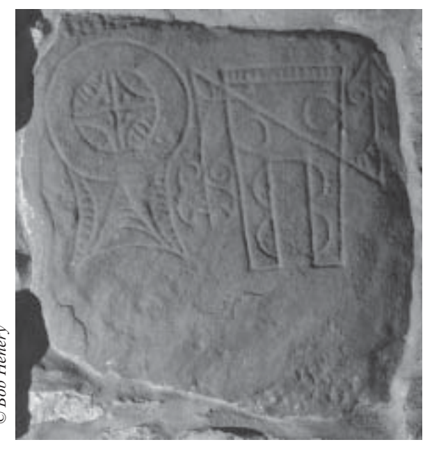
Arndilly Symbol Stone

from the rim and on some of them off-centre. The circular section of the mirror-case on Westfield 1 in Fife is especially similar to the double disc and Z-rod symbol on that stone.