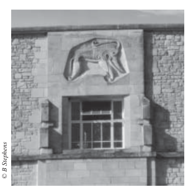
The biggest beastie? Pictish beast based on the symbol on Dyce 1