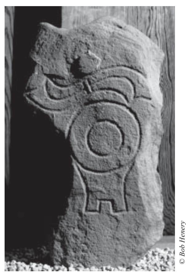
Kintradwell 1 Symbol Stone