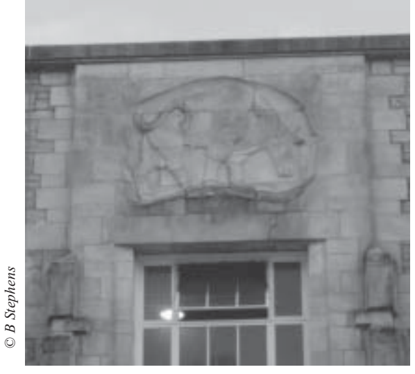
Pictish bull, based on one of the Burghead stones

After this year's Inverness conference I headed off to paddle the lochs of Glen Affric with the trees in their autumn colours, something that's been on the 'to do' list for a long time. Passing Fasnakyle Power Station on the way back (in my car, not the canoe!) I noticed high up, just below the eaves, some large carved stone panels that are described on Canmore and in the Listed Building description as Pictish symbols or beasts.