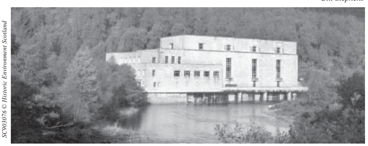
Fasnakyle power station from the south east.